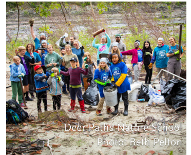
Deer Paths Nature School