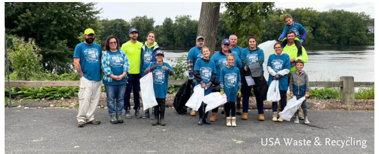
USA Waste & Recycling