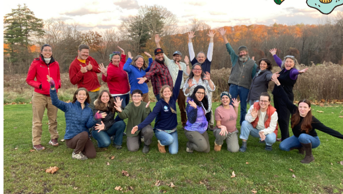
Connecticut River Conservancy staff in November, 2023.

THANK YOU for all you do to contribute to cleaner, healthier rivers. While the Source to Sea Cleanup is a major annual event, the work of Connecticut River Conservancy and our many regional partners happens all year round. From removing old dams and invasive species to advocating for better policies and testing water quality in our lab, we take a watershed-wide approach to just about everything we do. And your support makes this possible!