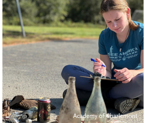
Academy of Charlemont