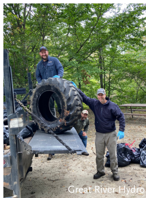
Great River Hydro