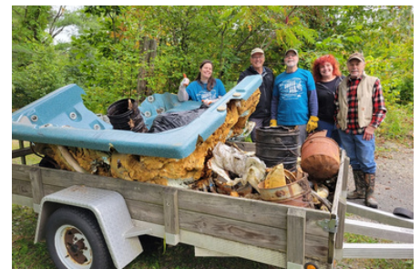
The Deerfield River Watershed Trout Unlimited group found a hot tub!

Hot tub, bowling ball, Hibachi grill, fishing boat, refrigerator, case of whipped cream, message in a bottle, snowboard, car engine, 90's cellphone, ironing board, children's rocking chair, flatscreen TV, couch, bathroom vanity, horseshoes, vending machine, soda dispenser.