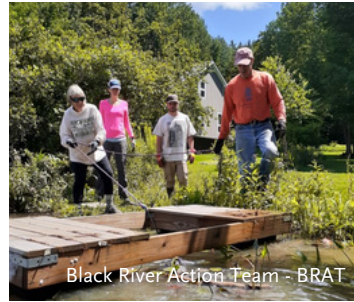
Black River Action Team - BRAT