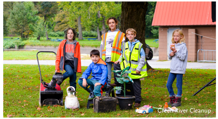
Green River Cleanup