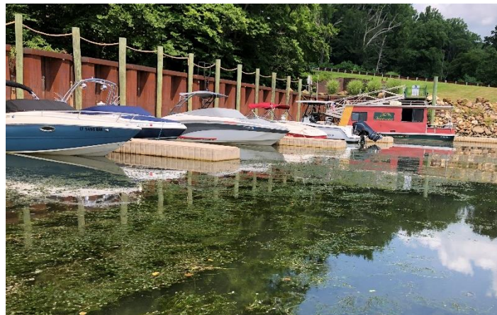
Figure 1. Hydrilla in St. Clements Marina, Portland CT.