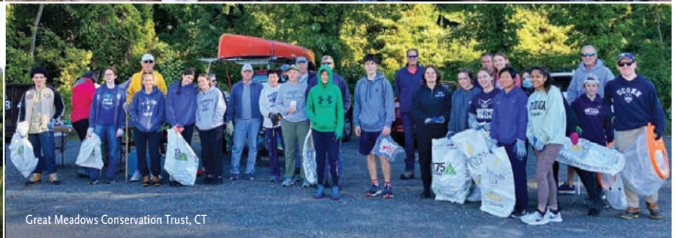
Great Meadows Conservation Trust, CT