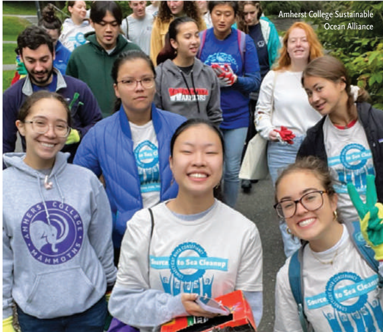
Amherst College Sustainable Ocean Alliance