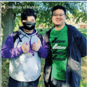
University of Hartford