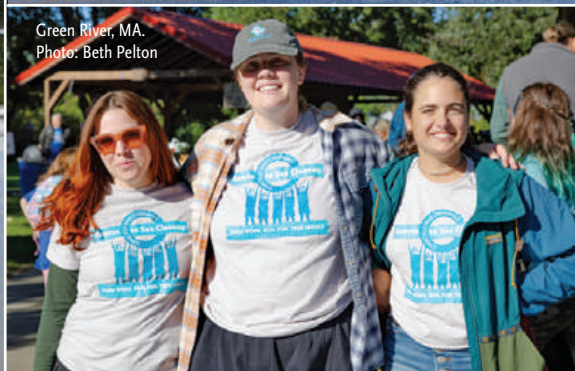
Green River, MA.