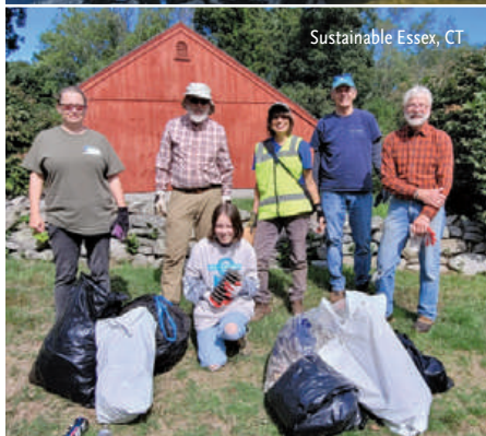
Sustainable Essex, CT