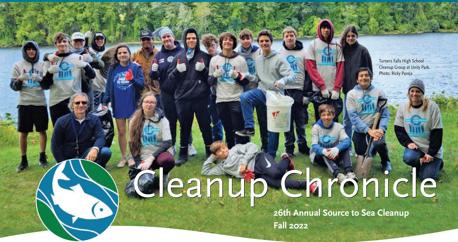
Turners Falls High School Cleanup Group at Unity Park.