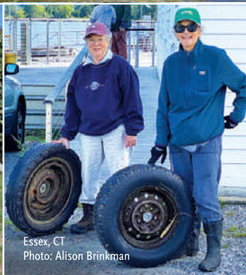
Essex, CT