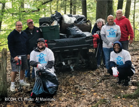
RICOH, CT.