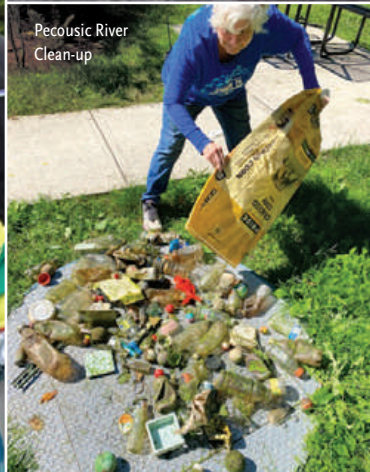
Pecosic River Clean-up