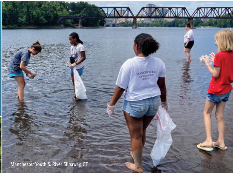
Manchester Youth & River Slipway, CT

While the Source to Sea Cleanup is an annual initiative, our #RiverWitness community is active all year round on social media! In addition to capturing the beauty of nature in its purest form, we invite you to show the dirty truth of trash in our rivers and the need for trash solutions. Join us in being a voice for our local rivers by sharing what you see on social media using the hashtag #RiverWitness, and check out the tag to see what others have posted.