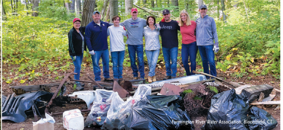
Farmington River Water Association, Bloomfield, CT