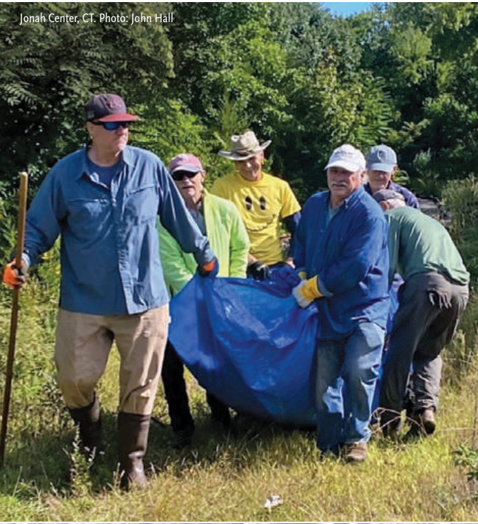
Jonah Center, CT.